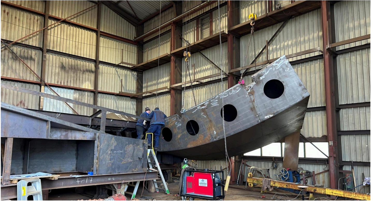
Construction is seen in the Netherlands of a steel stage planned for Luther George Park in Springdale.