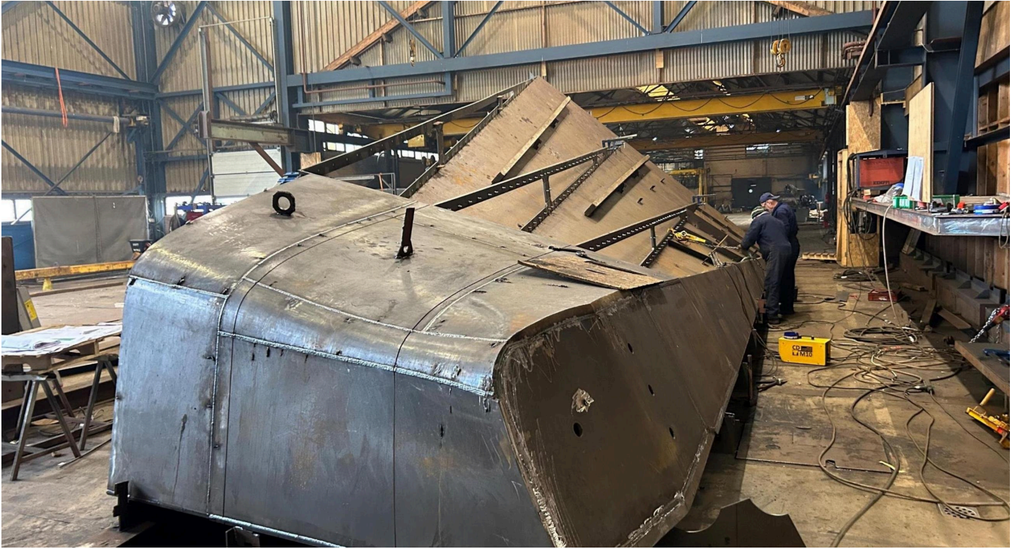
Construction is seen in the Netherlands of a steel stage planned for Luther George Park in Springdale.