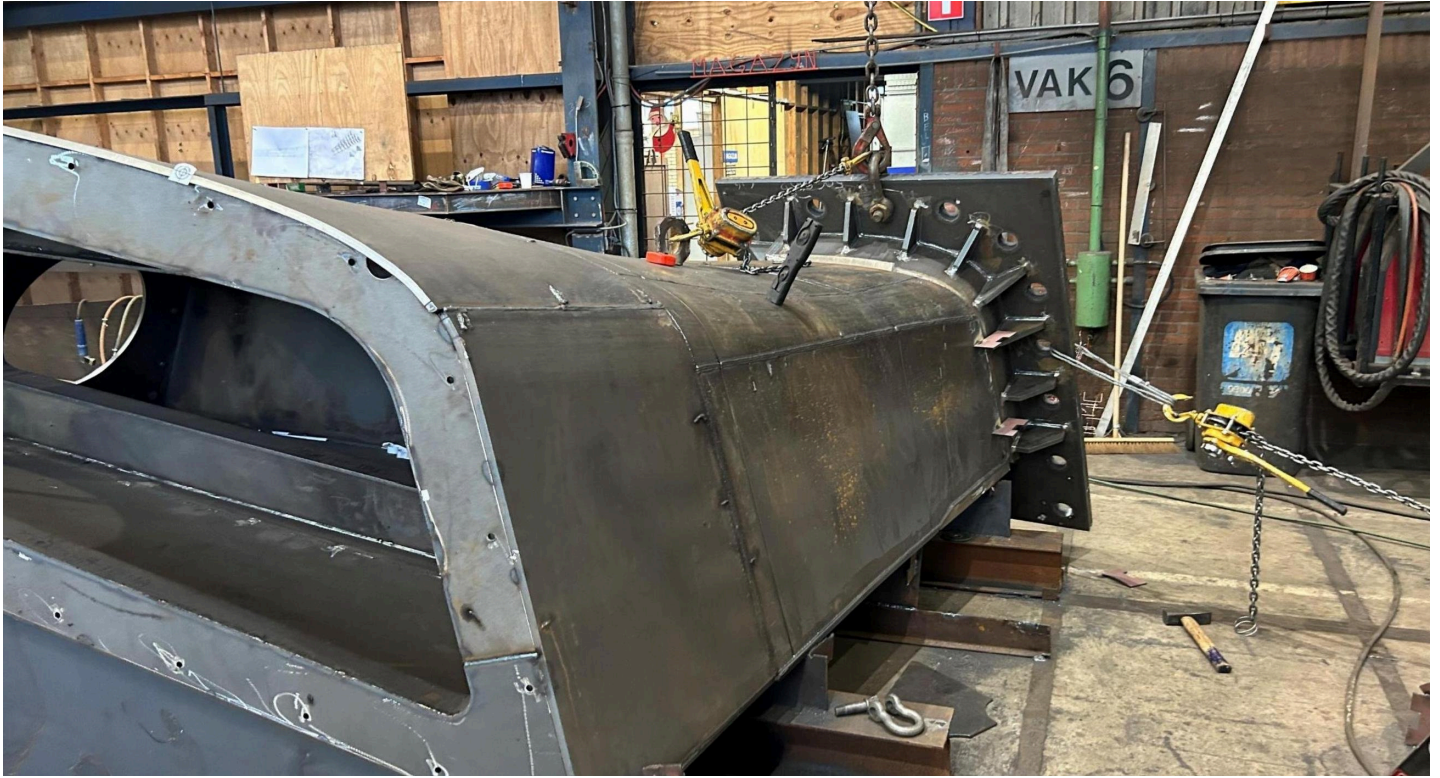
Construction is seen in the Netherlands of a steel stage planned for Luther George Park in Springdale.